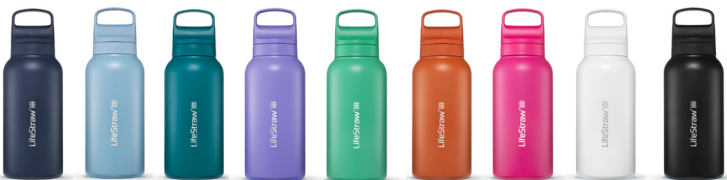
Aegean Icelandic Laguna Thistle Cactus Kyoto Orchid Polar Nordic Noir

Carbon filter + the membrane microfilter filters bacteria, parasites, microplastics, chlorine, and more while improving taste.