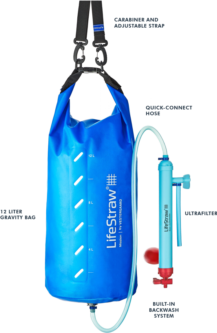
12 LITER GRAVITY BAG

Weight: 1.17lbs | 0.53kg Size: 18.7in x 10.6in Hose Length: 27.6in