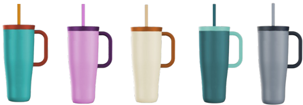
Havana Acai Terracotta Laguna Icelandic

Carbon filter + the membrane microfilter filters bacteria, parasites, microplastics, chlorine, and more while improving taste.