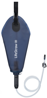
Mountain Blue 3L

2x thicker, premium materials make it tougher so no worrying about rips, tears or punctures.