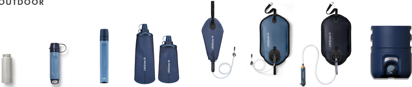
LifeStraw Activated Carbon Peak Series Filter LifeStraw Solo Peak Series LifeStraw Pearsonal Straw Peak Series LifeStraw Squeeze Collapsible Bottle (650ml & 1L) LifeStraw Gravity 3L Peak Series LifeStraw Gravity 8L Peak Series LifeStraw Gravity Purifier Water Purifier With Virus Removal LifeStraw Escape Pressurized Water Purifier