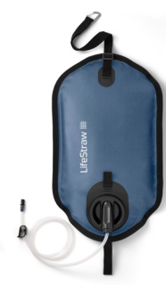
Peak Gravity 8L