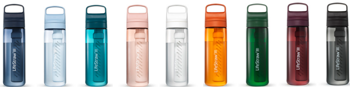
Aegean Icelandic Laguna Cherry Blossom Polar Kyoto Oxford Ivy Wild Mulberry Nordic Noir

The membrane microfilter lasts up to 4,000 liters. That's 8,000 single use plastic water bottles out of our parks, our oceans, and our communities.