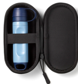
Carry Case Add On

Weight: 1.7oz | 48.2g Height: 5.1 x 1.3in | 12.9cm x 3.30cm