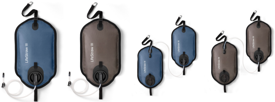
Mountain Blue 8L Dark Mountain Gray 8L Mountain Blue 8L+8L Dark Mountain Gray 8L + 8L

Made with premium materials resistant to punctures and rips during your travels.