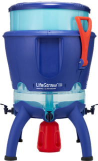
LifeStraw Personal Water Filter