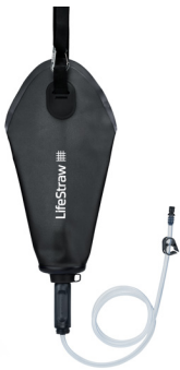
Dark Mountain Gray 3L