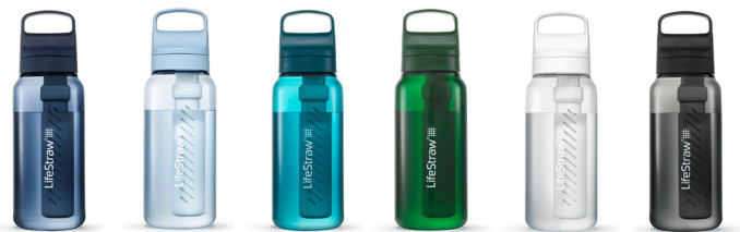
Aegean Icelandic Laguna Oxford Ivy Polar Nordic Noir

The membrane microfilter lasts up to 4,000 liters. That's 8,000 single use plastic water bottles out of our parks, our oceans, and our communities.