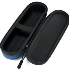
Add On Carry Case

Weight: 2.3oz | 65g Height: 1.26 x 7.7in | 3.2cm x 19.50cm