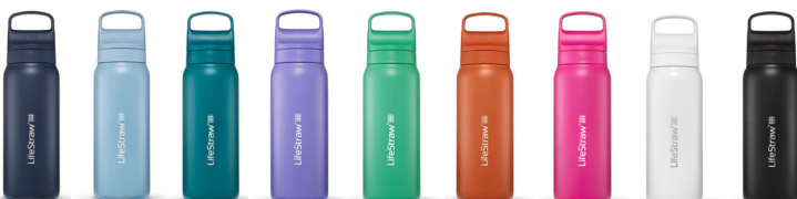
Aegean Icelandic Laguna Thistle Cactus Kyoto Orchid Polar Nordic Noir

Carbon filter + the membrane microfilter filters bacteria, parasites, microplastics, chlorine, and more while improving taste.